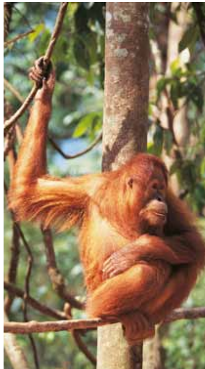
Orang utan, Borneo

Comfortable Land Travel: For road journeys, Cox & Kings uses air-conditioned buses of a size