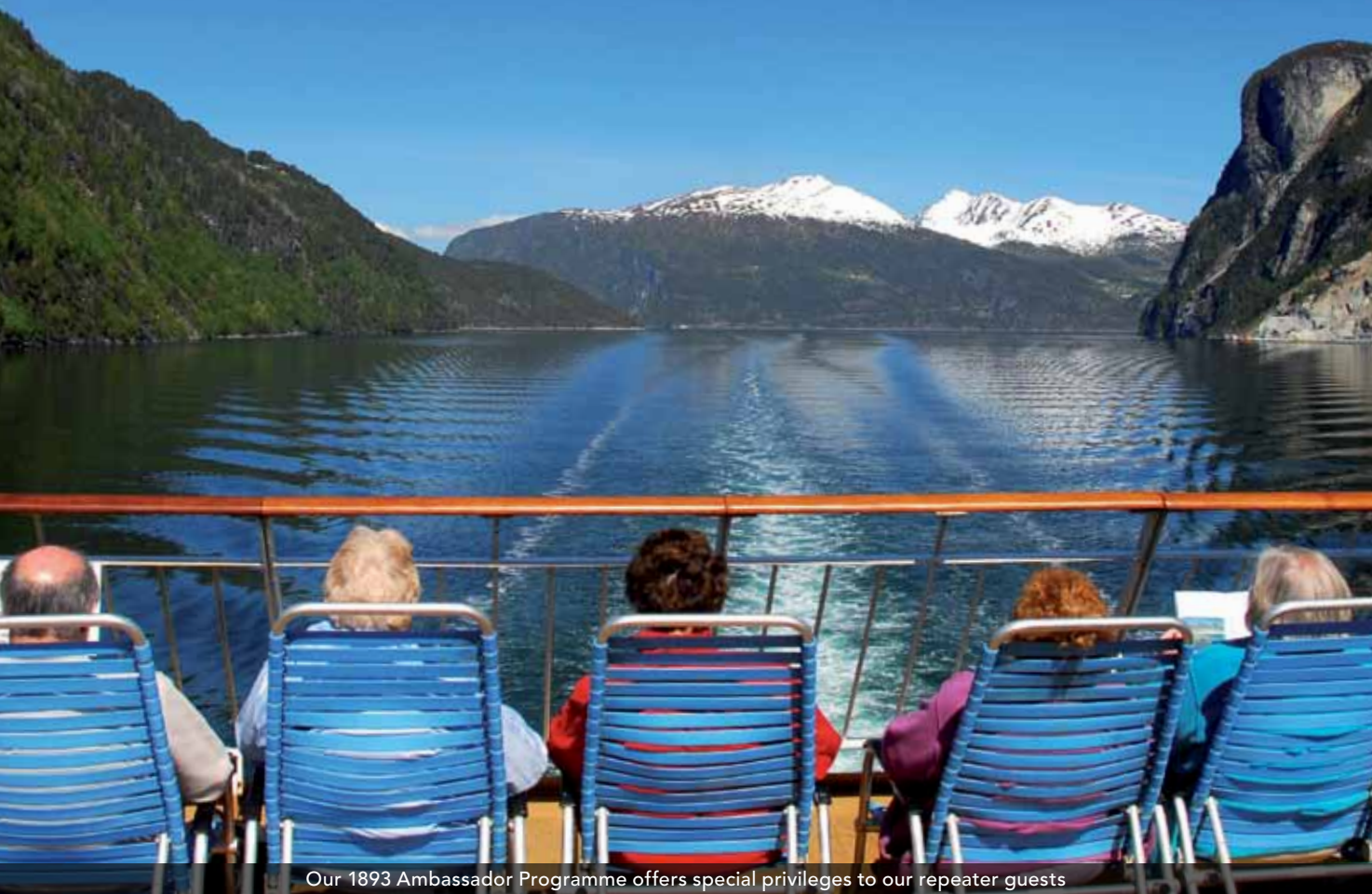
Our 1893 Ambassador Programme offers special privileges to our repeater guests

Hurtigruten would like to present its 1893 Ambassador Programme, and invite you to join and discover the variety of our unique destinations with special extras as an 1893 Ambassador member. This is a complimentary membership for all guests who have travelled with us for a minimum of three nights on a previous single journey.